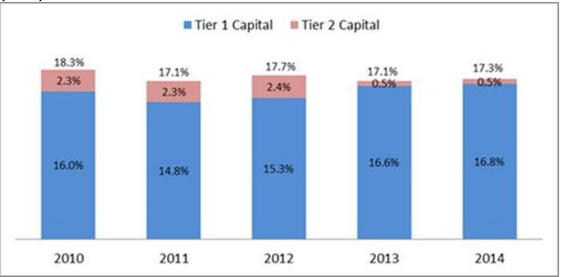
* For the purposes of presentation, the Tier 1, Tier 2 and Total Capital related ratios after 2012 are calculated using the framework and the methodologies defined under the Basel III framework. The comparative ratios for 2012 and earlier years are calculated under Basel II and have not been restated.

In accordance with SAMA's minimum capital requirements, the Bank provides capital for the core banking risks (Credit, Market and Operational Risk) in accordance with Pillar 1 of the Basel Accord. As depicted below the Bank has consistently maintained a strong Capital Adequacy Ratio (CAR):