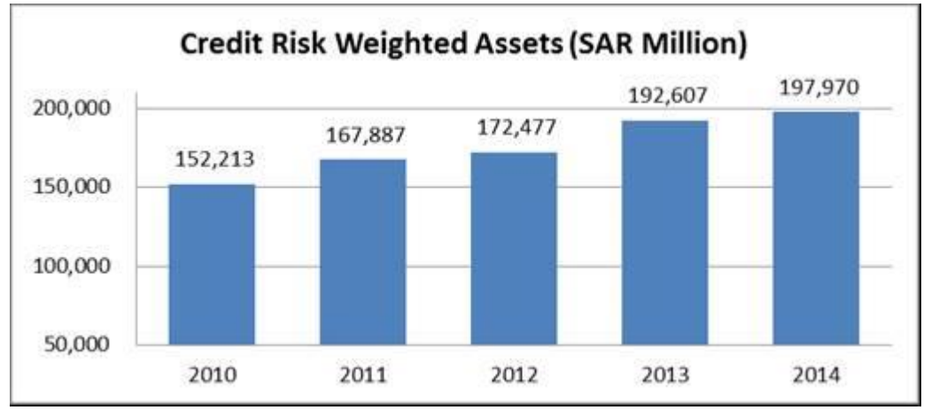
* For the purposes of presentation, the Credit RWAs, after 2012 are calculated using the framework and the methodologies defined under the Basel III framework. The comparative balances for 2012 and earlier years are calculated under Basel II and have not been restated.

Effective 1 January 2008, with the approval of SAMA, the Bank adopted the Standardized Approach for measurement of credit risk for capital adequacy purposes. Credit risk capital assessment is calculated by extracting all credit risk exposures and risk categories and mapping this to appropriate Basel asset classes. The credit risk system provided by independent external vendors then calculates risk weighted assets for capital allocation purposes; the table below provides Bank's Credit risk weighted assets under the Standardized Approach as per SAMA guidelines: